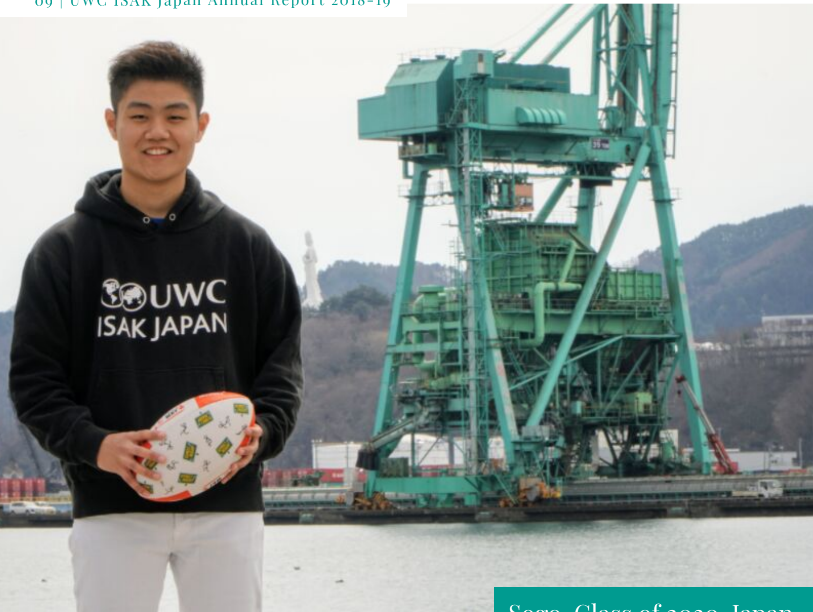
Sogo, Class of 2020, Japan